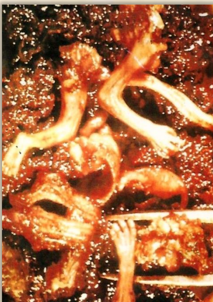
Photo of a child killed by induced abortion

to life. Consequently, from that moment of conception in the maternal womb, the child possesses the same rights as a child once born. On speaking here of abortion, we refer solely to criminal abortion, namely wilfully induced. Criminal abortion is the interruption, wilfully induced, of the development in the maternal womb of a human being conceived, living, with the direct or indirect intention of depriving the child of life. This crime is considered abortion whether it is an embryo, foetus or immature human being, for whom it is impossible to live outside the mother's womb, or whether it is a human being already mature whose delivery from the maternal womb is accelerated with the intention of killing him. Abortion can be induced: sometimes by the pregnant woman herself by way of excessive physical exercises, or abortive medicines; or by others using manipulations;