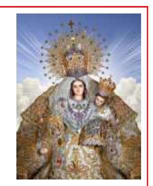
One, Holy, Catholic, Apostolic and Palmarian Church